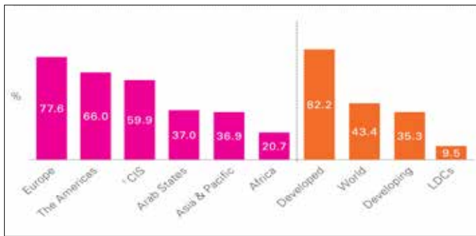
Figure 2: Percentage of Individuals Using the Internet

Source: ITU World Telecommunication/ICT Indicators database, reproduced with permission.